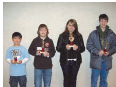
Regional Spelling Bee Winners

Forum Communications is the official newspaper sponsor of the Multi-Region State Spelling Bee. The Service Cooperatives are very grateful to Forum Communications for providing this opportunity and including the schools in our service area. Their sponsorship included the Regional Spelling Bees for the following Service Cooperatives: Lakes Country Service Cooperative in Fergus Falls, Northeast Service Cooperative in Mountain Iron, Northwest Service Cooperative in Thief River Falls, Resource Training & Solutions in St. Cloud, Southeast Service Cooperative in Rochester, and the Southwest/West Central Service Cooperative in Marshall.