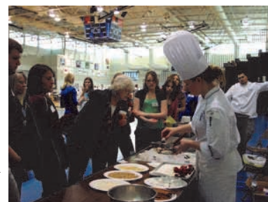
Le Cordon Bleu Presentation Chef's Session