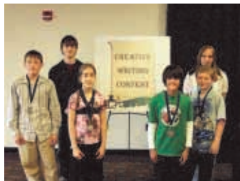
2nd Place Winners