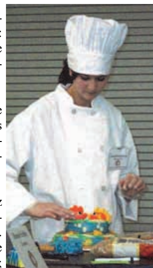
1st Place Cake Decorating Level II Competitor from Pipestone Area HS