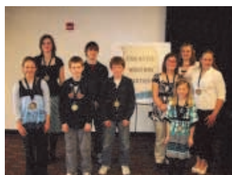
1st place Winners