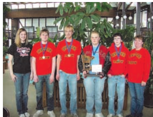
1st Runner Up Lac qui Parle Valley

Congratulations to all of our teams for doing a great job of representing their district and our area! Knowledge Bowl is sponsored by the eleven Service Cooperatives around the state.