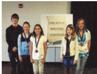
3rd place Winners