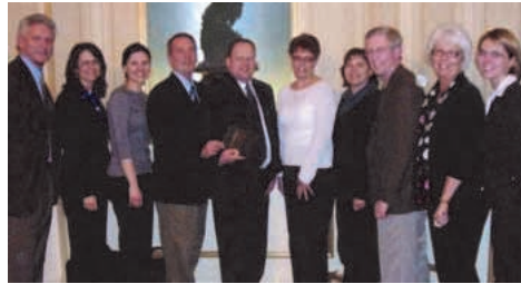
Pictured (left to right)